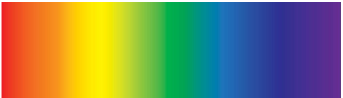
A colour spectrum in its natural order: red, orange, yellow, green, blue, indigo, and purple.