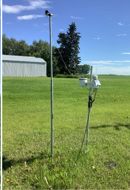
iMETOS ECO D3 weather station set up near the crop boundary on Steckler Farm which is the Olds College research location for the Pan-Canadian Smart Farm Network.