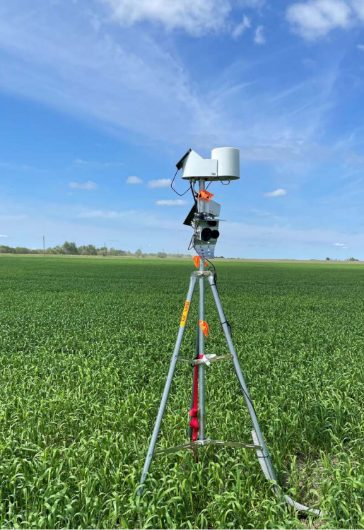
In-field weather station installed at Lakeland College Student-Managed Farm - Powered by New Holland.