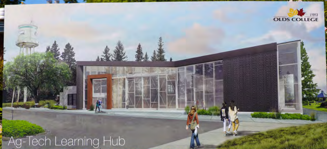
Ag-Tech Learning Hub